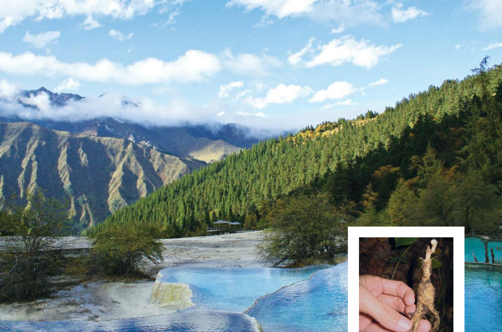
SICHUAN, KNOWN AS "LAND OF ABUNDANCE," IS THE LARGEST BASE FOR CHINESE MEDICINE, WITH ITS ANNUAL SALES OVER 100 THOUSAND TONS, COVERING ONE-THIRD OF THE TOTAL IN CHINA. HERE IS A PICTURE OF THE PRISTINE WATER FOUND IN THE SICHUAN HUANG LONG/JIUZHAIGOU VALLEY.