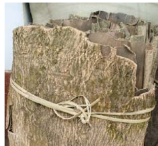
EVERGREEN SELECTS WHOLE, MEDICINAL-GRADE HERBS WITH ABUNDANT PHYTO-NUTRIENTS, RATHER THAN INEXPENSIVE SMALL PIECES.