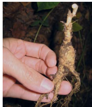
EVERGREEN PURCHASES FROM FARMERS THAT FOLLOW THE GOOD AGRICULTURAL PRACTICES (GAP) TO ENSURE SUSTAINABLE FARMING OF A WIDE RANGE OF QUALITY AND AFFORDABLE CHINESE HERBS.

After visual inspection, laboratory tests are performed to detect what cannot be seen or tasted. Evergreen uses Thin Layer Chromatography (TLC) to identify the unique component makeup of an herb to further guarantee its authenticity, and High Performance Liquid Chromatography (HPLC) to ensure that the bio-active constituents are present in proper concentration. Together, the TLC and HPLC guarantee accuracy in species and maximum deliverance of active ingredients in our herbs.