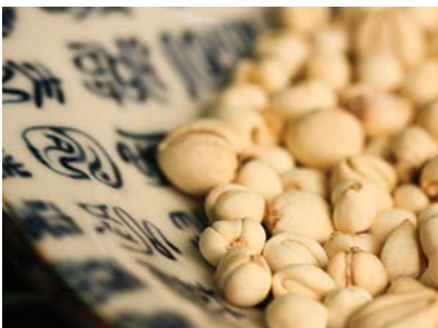
*CHUAN* BEI MU'S NAME INDICATES THAT THIS HERB IS BEST FROM THE "SICHUAN" REGION, AS THE SOIL AND CLIMATE PRODUCE THE HIGHEST DEVELOPMENT OF ITS THERAPEUTIC COMPONENTS.