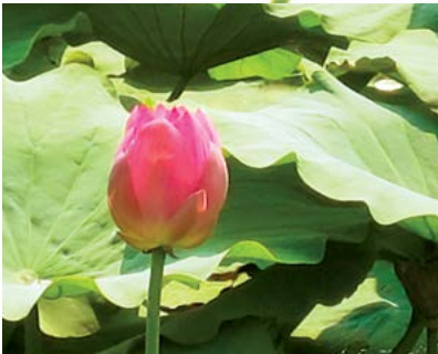
THE LOTUS PLANT IS AMONG THE MOST VERSATILE HERBS IN THE CHINESE MATERIA MEDICA. OVERALL, EIGHT DIFFERENT PARTS OF THE LOTUS PLANT ARE USED MEDICINALLY.